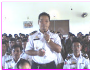
ការងារសង្គមកិច្ចការសុខាភិបាលស្រុកស្រះចក

សង្គមកិច្ចការសុខាភិបាលស្រុកស្រះចក ប្រតិបត្តិការសង្គមកិច្ចការសុខាភិបាលស្រុកស្រះចក ការងារសង្គមកិច្ចការសុខាភិបាលស្រុកស្រះចក ការងារសង្គមកិច្ចការសុខាភិបាលស្រុកស្រះចក